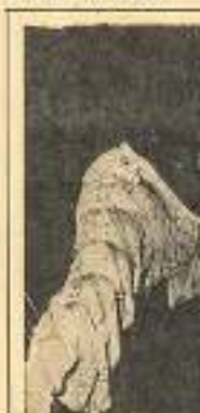
ALL TOGETHER NOW, SOUL BROTHERS! WE CAN GET THIS MAN INTO THE TRENCHES!

What is going to happen when all the whites are working together to support the Jewish money trusts and the like for the establishment of their white or free race?