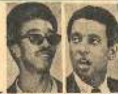
Dr. J. Edgar Hoover... Robert Kennedy...