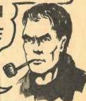
Design: Joseph Hubbert